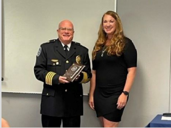
CIT Department of the Year Glendale Police Department