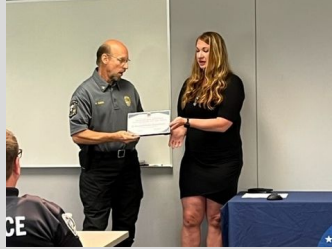
Honorable Mention St. Bernard Police Department